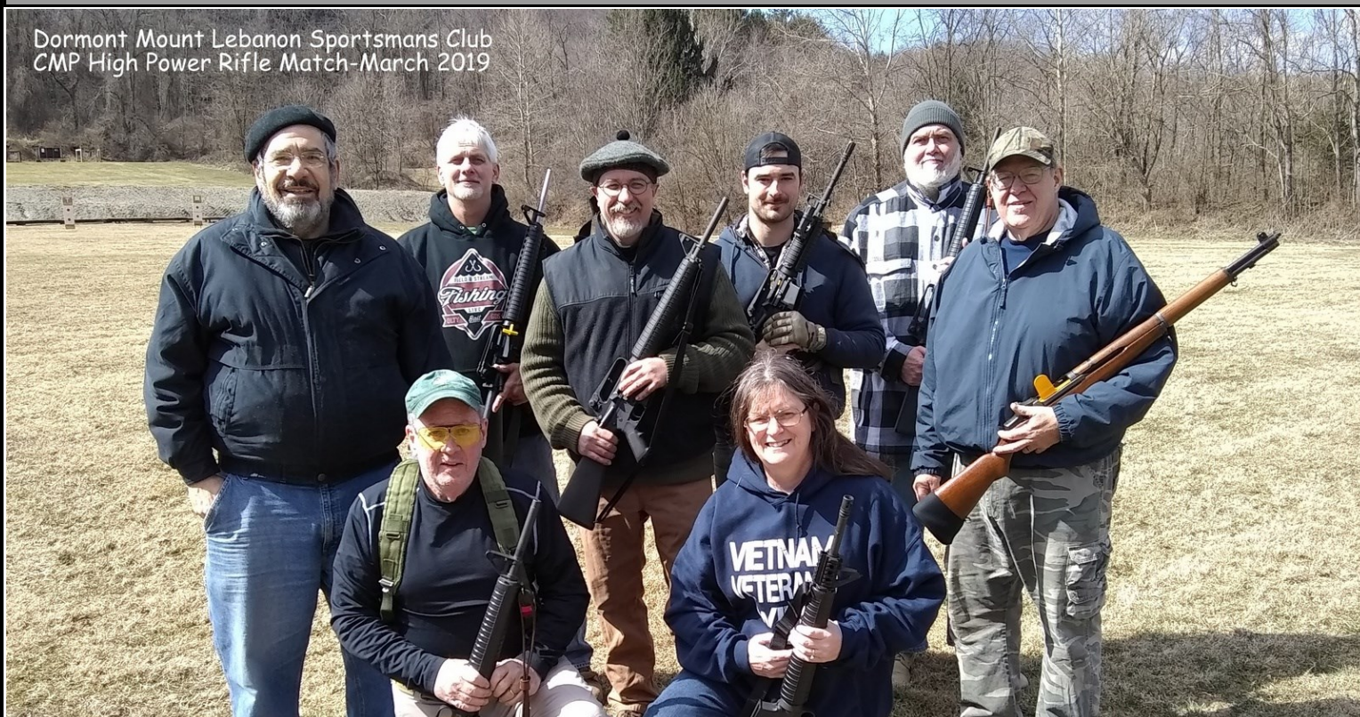
Dormont Mount Lebanon Sportsmans Club CMP High Power Rifle Match-March 2019