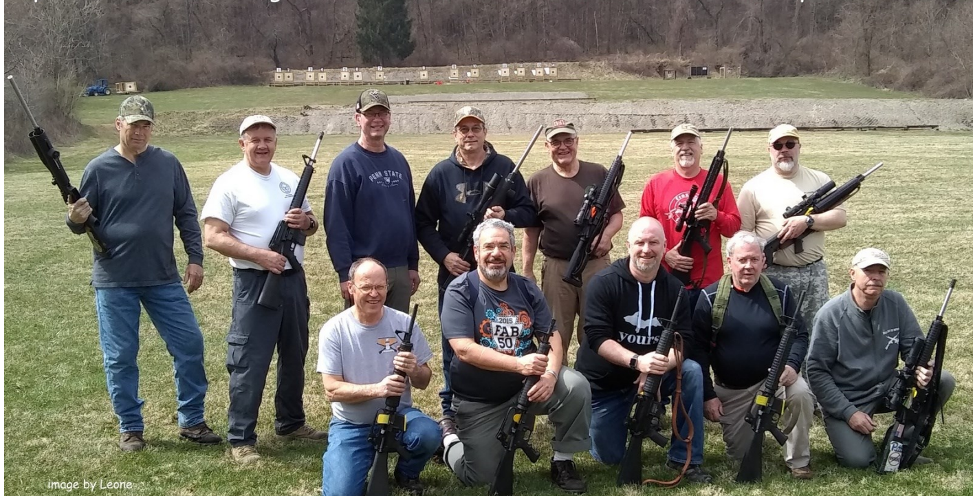
April 6, 2019 - NRA High Power Rifle Match - Dormont Mt. Lebanon Sportsmens Club