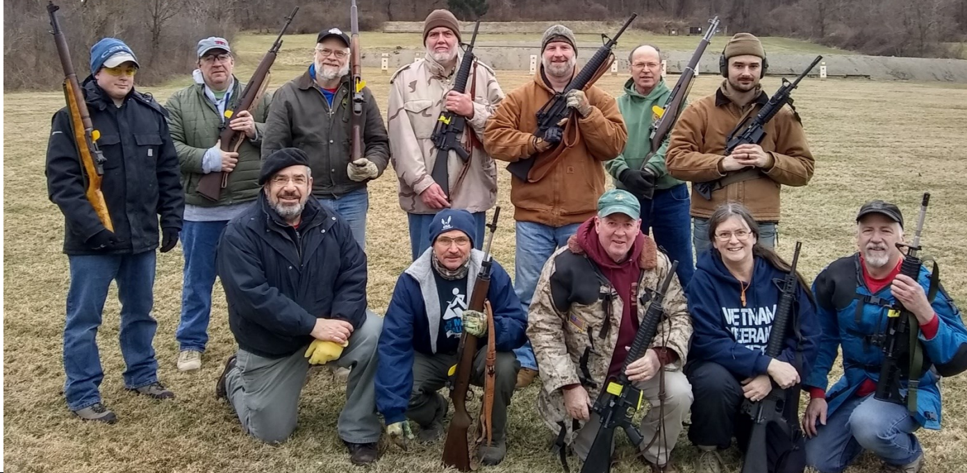
CMP High Power Rifle Match Dormont-Mt. Lebanon Sportsmen February 17th, 2019